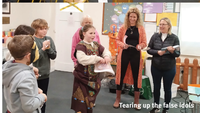
Tearing up the false idols