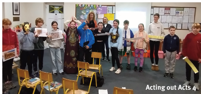
Acting out Acts 4