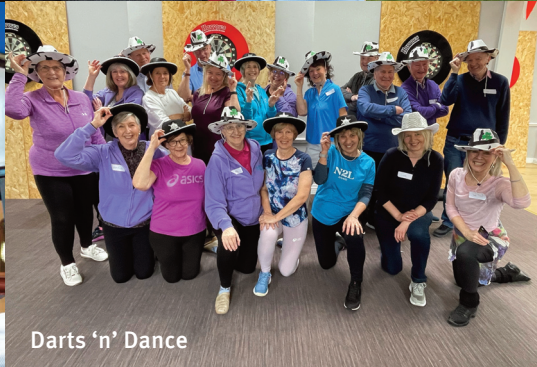
Darts 'n' Dance