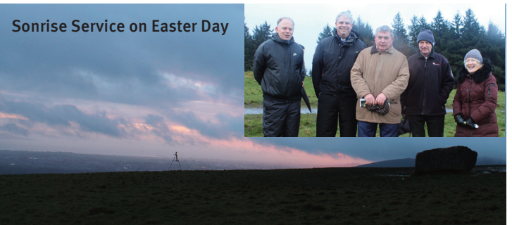
Sonrise Service on Easter Day