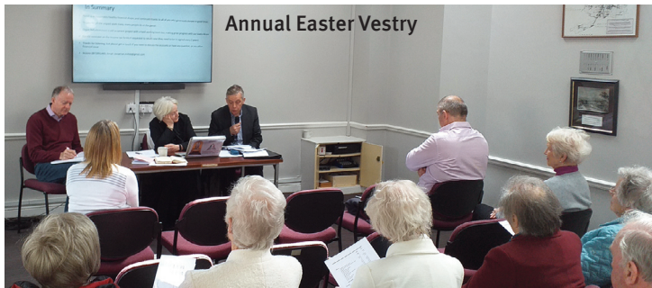
Annual Easter Vestry